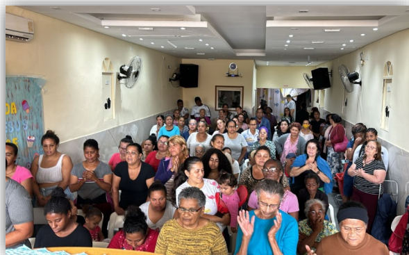
the new church