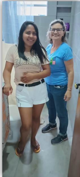
Nothing but smiles